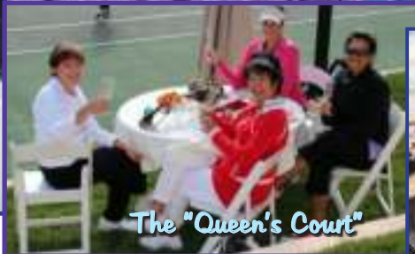
The "Queen's Court"